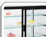
Rear sliding doors in Thermopane glass