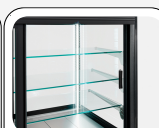
Refrigerated glass shelves